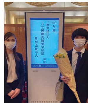
At the award ceremony!