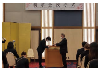
Receive a certificate and give a thank you speech in Japanese!