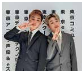
FUNG twins enrolled in TCA

P.3 • Employment Results • International students admitted from abroad