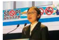
The presentation at the entrance ceremony

Her design won the competition for the 'Wrapped Advertisement Illustration Design of Osaka Monorail,' which was offered by the Osaka Prefectural Traffic Countermeasures Council with the aim of promoting traffic safety awareness among the people of Osaka. She presented her work. The wrapped train is named "Osaka Kotsu Anzen Go" and has been running from Kadomashi station to Osaka airport station for an year since September 23rd, 2022.