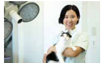
Goal: Become a veterinary nurse!

While you may face challenges during your school life, I hope that future international students will create many enjoyable memories by engaging in Japanese communication.