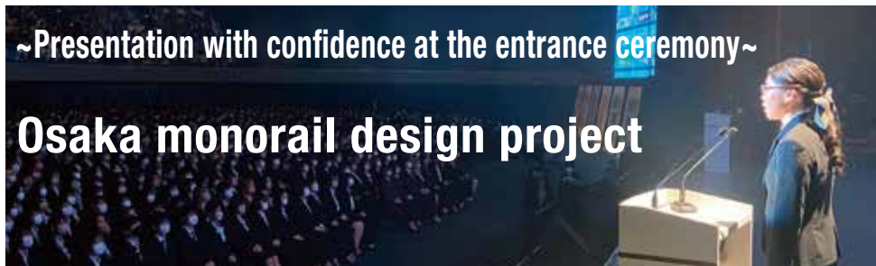
Osaka College of Animation and e-Sports Comic Illustration Course (Graduate)