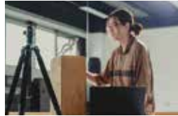
Modeling for CG production

I was influenced by Japanese animation in my childhood and often watched movies and animation in my college life. By chance, I took a film production class where I discovered that it was not only enjoyable to watch films but also to create them. Therefore I decided to study abroad in Japan.