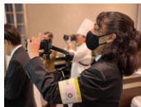
Captured the process of making sweets

I participated in the shooting the making video of the 'PIERRE HERMÉ PARIS 25th Anniversary Party'. Unlike my usual shooting style, I wore a suit for the shoot. Since it was a making shoot for an event with many participants this time, I made sure to be careful around me while shooting. It was my first time participating in an external shoot, and there were equipments I had never used before, so I prepared and practiced in advance with the guidance of my seniors. There were some accidents during the shoot, but we were able to finish the shooting safely. Understanding the causes of the issues that occurred, I would like to challenge corporate projects again. In the future, I want to participate in various shooting locations and gain various experiences.