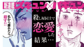
His ongoing series