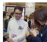
Giving visitor explanation about his work